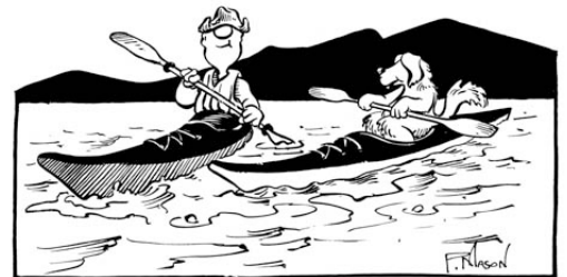
Paddle with a friend

The term of office is January 1 – December 31 st . In November, Directors and Coordinators attend a special Joint meeting with outgoing and incoming members to exchange information and create a vision for the coming year(s)